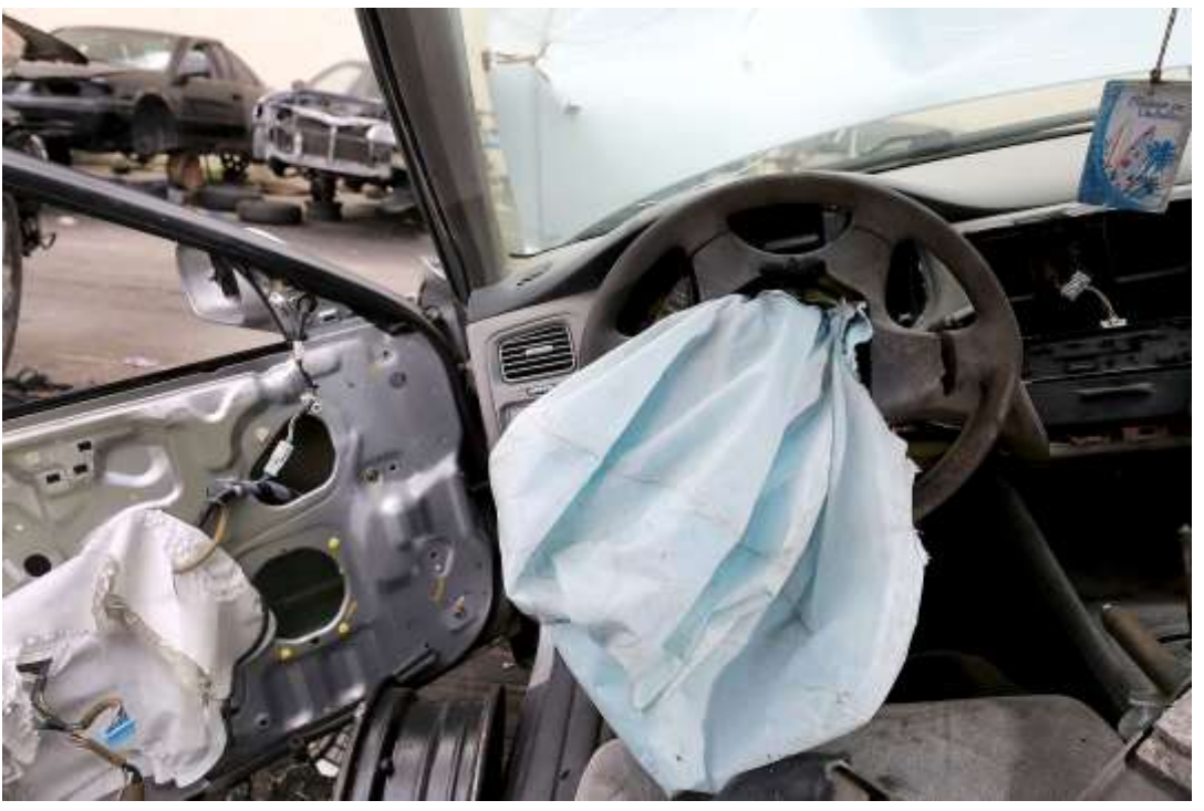
Continued on page 10...

According to NHTSA "Approximately 67 million Takata air bags have been recalled because these air bags can explode when deployed, causing serious injury or even death. Long-term exposure to high heat and humidity can cause these air bags to explode when deployed." https://www.nhtsa.gov/equipment/takata-recallspotlight. Another massive recall is looming too.