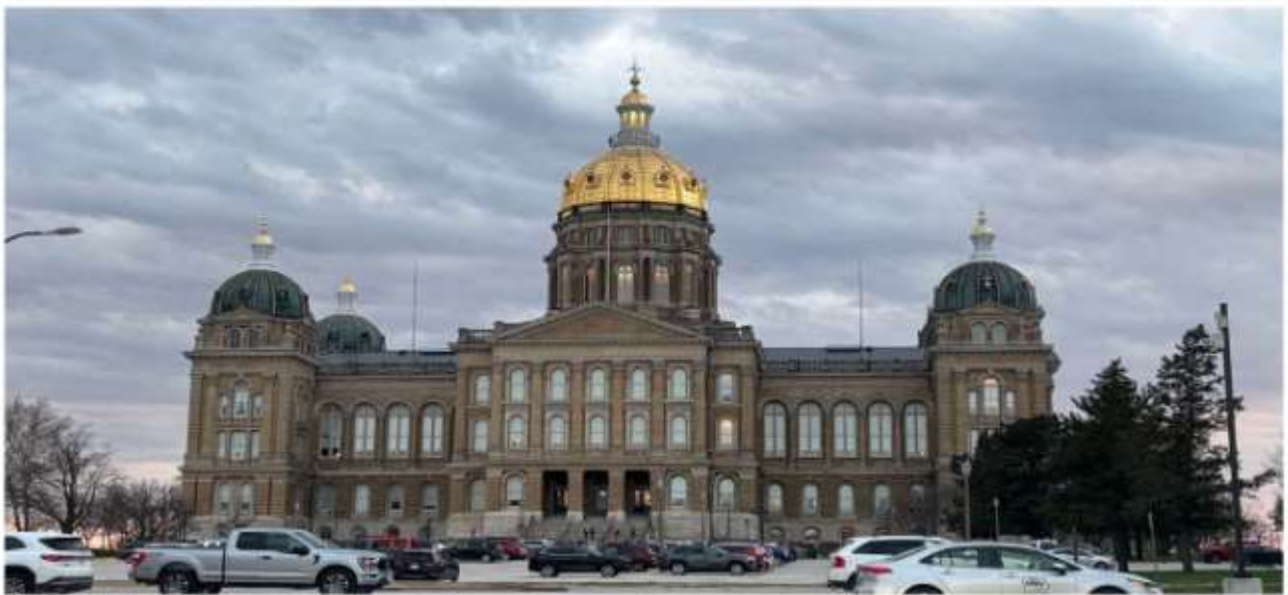
Lawmakers depart the Capitol Wednesday evening.