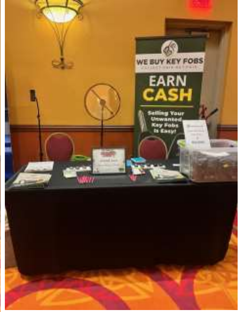
Best Overall Display– We Buy Key Fobs

Thank you! Exhibitors, Sponsors and Speakers!