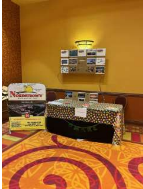
Most Creative Theme– Nordstrom's