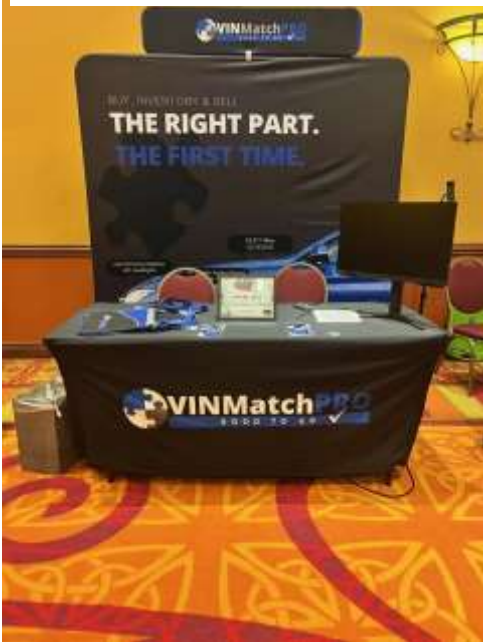
Best Sales Person– VinMatchPro