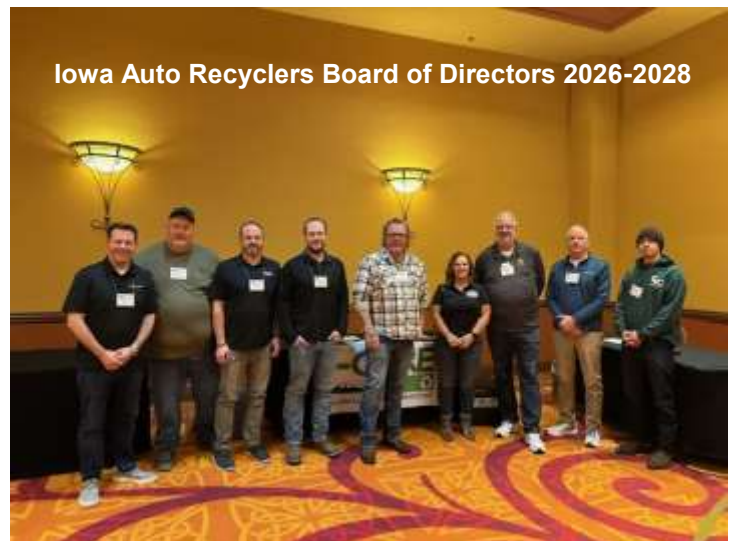
Iowa Auto Recyclers Board of Directors 2026-2028

The GMARE trade show is a highlight of the event each year, our exhibitors play a huge role in its success. Congratulations to this year’s award winners!