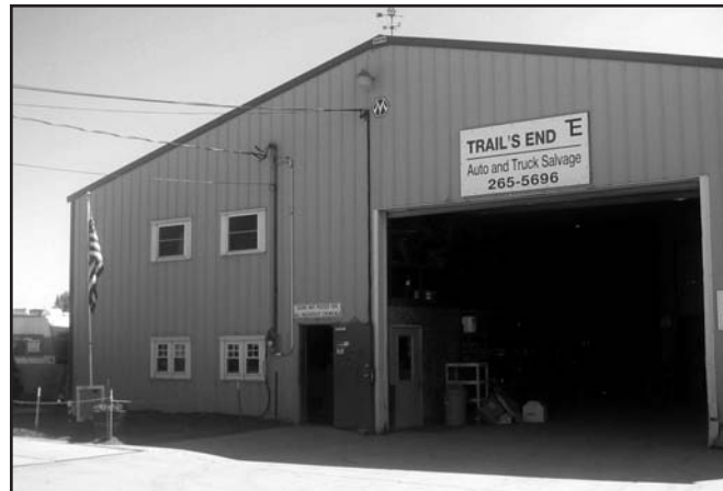
Trail's End Auto & Truck Salvage in Des Moines,